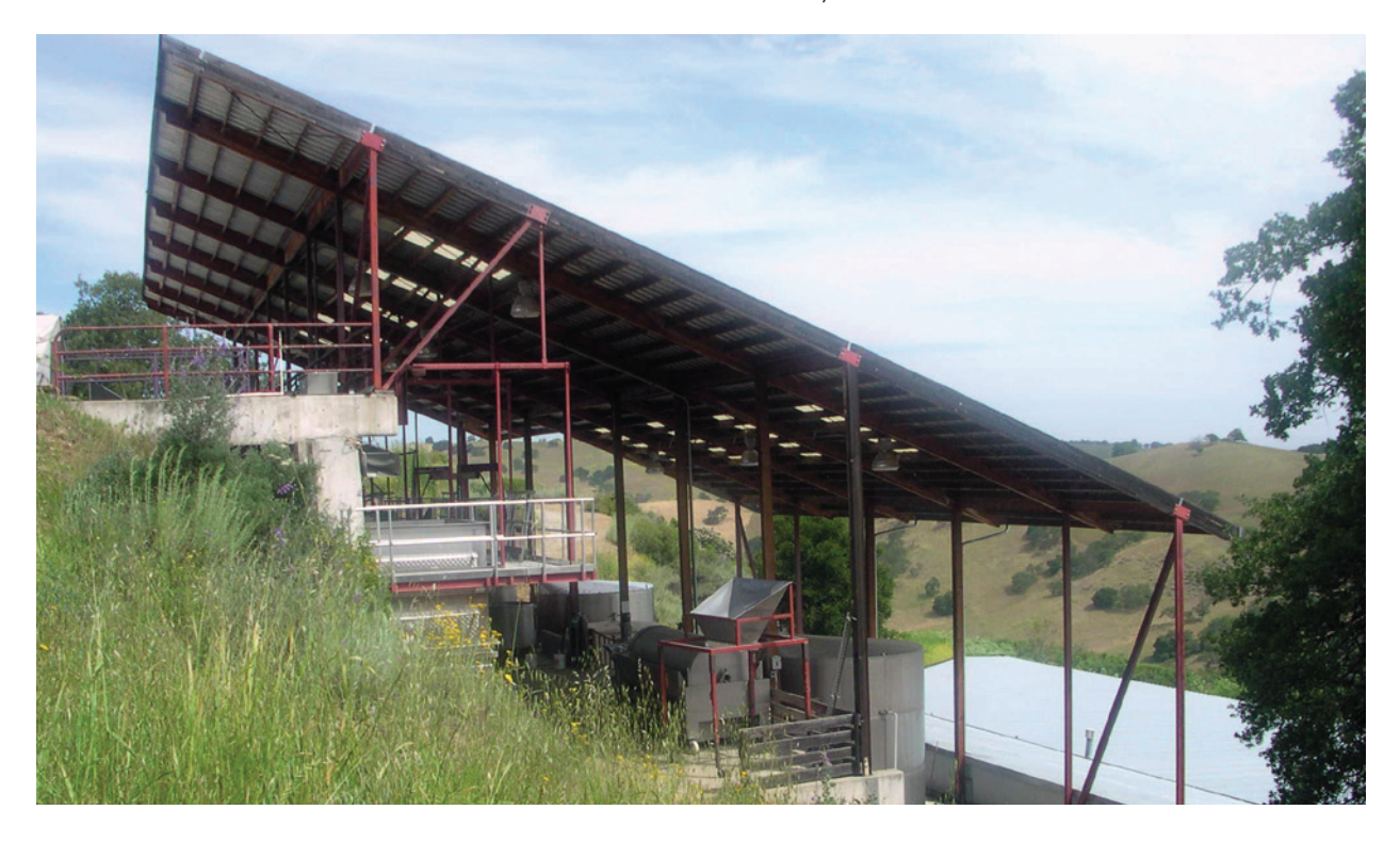
Calera's GRAVITY FLOW winery is an old rock-crushing plant.

He forged ahead with his dream anyway and planted three Pinot Noir vineyards in 1975. In 1984 he added a fourth Pinot Noir block and 6.1 acres of Chardonnay.