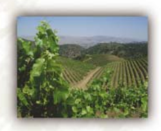
JENSEN VINEYARD, MT. HARLAN