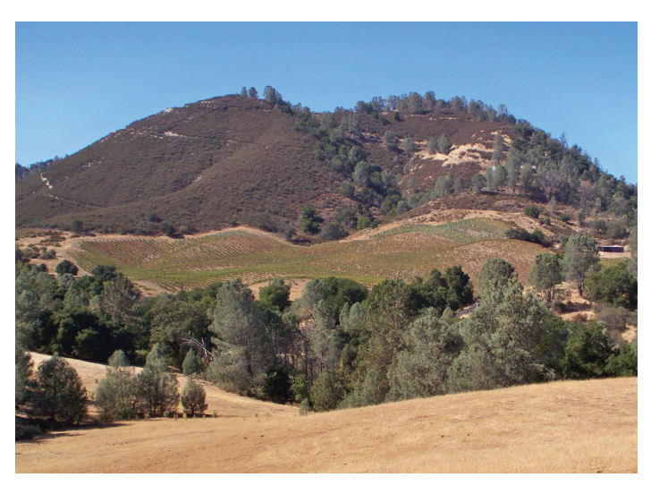
View of Calera's Mills and Chardonnay vineyards at Mt. Harlan.

Calera has two rows of Aligoté in the Jensen vineyard and four in the Chardonnay vineyard. Only 330 vines in total.